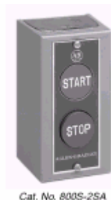
Two pushbutton station shown less buttons