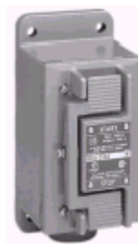
Car. No. 800S-2SA4